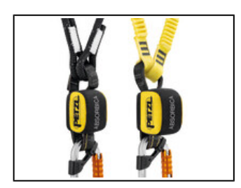
The energy absorber's very compact design doesn't hinder the user during progression.

ABSORBICA-Y MGO is a double lanyard with compact energy absorber, designed for progression on a vertical structure or a horizontal lifeline, and for passing intermediate anchors. It works with users who weigh between 60 and 140 kg. It's ready to use, with two large-opening MGO connectors on the end of the lanyard and an OK TRIACT-LOCK connector for harness attachment. It is available in two versions: 80 (rope arms), or 150 FLEX (elasticized arms).