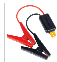
Smart jump lead