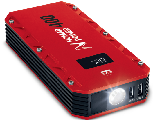
Colour LCD display

Lightweight (498 g) and compact , it will ideally find its place in a vehicle's glove box/tray as well as in a suitcase.